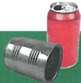
Steel, Tin, Aluminum Cans and Aluminum Foil