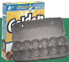
Egg Cartons Cereal & Cracker Boxes

You can now place ALL of these items in one bin or bag!